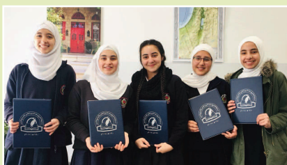
Five new school scholarships awarded in 2019

School scholarships funded (2007 - to date) £210,765