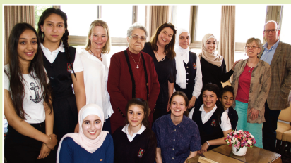
Most recent DSMT visit

DSMT's two scholarship programmes with Dar Al-Tifel Girls School, East Jerusalem have been funding access to school and higher education for disadvantaged girls each year since 2007, supported by donations from individuals and companies, including Kroll, Abraaj Capital, ABC International Bank, Council of Arab Ambassadors, Shell, Dar Lighting, Canning Trust.